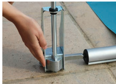
Crank handle close up

The Walu-Move is designed to raise the leading edge of the cover away from the pool and therefore reducing the effort required in moving the cover onto and off the pool. The wheel system lifts the cover and turning the vertical crank winds the cover and runs the wheels back down the pool. For covering the pool, simply pulling the central pulling strap easily draws the cover back onto the pool. When covered, the wheels are pivoted onto their end allowing the cover to be tensioned. In addition, a re-chargeable motor box is available to drop into the top of the Walu-Move and remove the need for the manual crank.