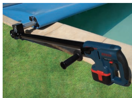
Walu-matic powered crank handle